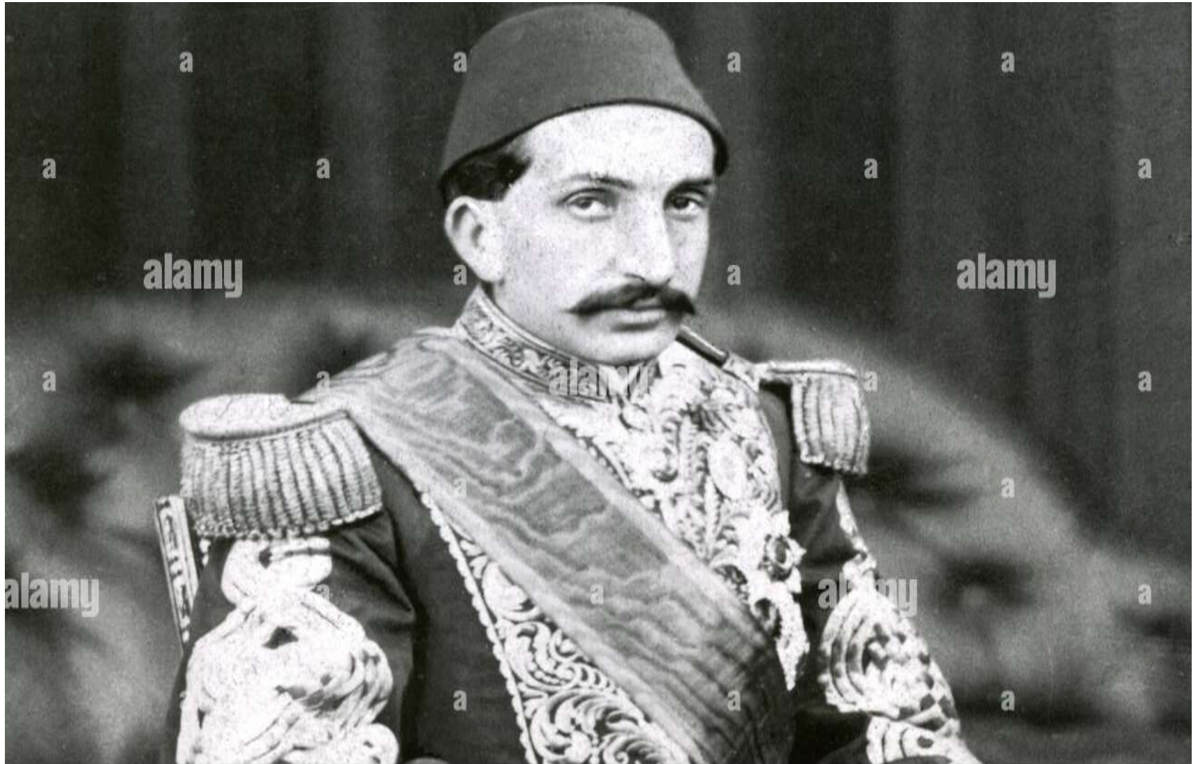
Portrait of Sultan Abdul Hamid II (autocratic ruler).